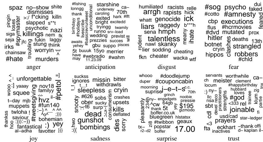
Fig. 1. A visualisation for the expanded emotion lexicon.