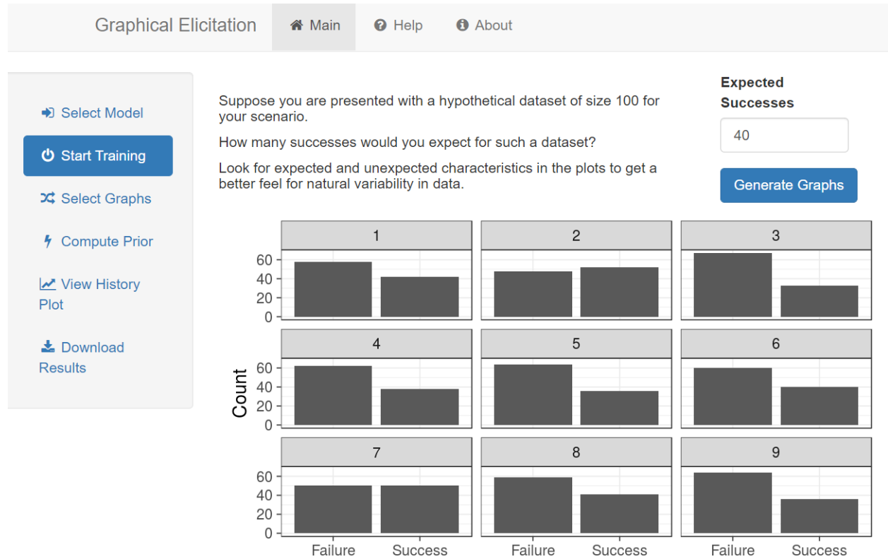
Figure 3 Training Step of the Graphical Elicitation Method.

method with Example 1, the user begins by selecting an initial model distribution; the distribution on Y , a Bernoulli distribution. The tool automatically selects a conjugate prior distribution on the parameter, a Beta Distribution. The user will then select the expected number of successes out of 100, automatically generating plots of what the number of successes vs. failures would look like, see Figure 3. Changing the number of successes, the expert can then see how the resulting plots will change. This can be thought of as a Predictive Elicitation technique as the user is observing plots of the data, not the parameter. After training the expert, the tool then displays a collection of sample data histograms of which the expert must select those that are similar to what they believe the data would be. From there, the prior distribution is formed from the selected histograms. Casement and Kahle (2018) suggest this method simplifies the statistical knowledge required to produce a prior distribution, significantly reduces the time of training the expert and the processing time of forming a prior distribution. However, experts still need partial statistical understanding to complete the task of outputting a prior that is consistent with their beliefs.