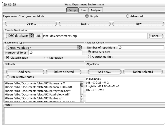
Figure 1.3. The Experimenter interface.

processed incrementally by those filters and learning algorithms that are capable of incremental learning.